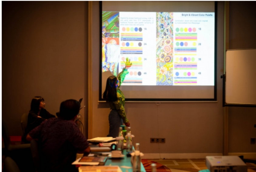
Jinju Culture and Tourism Foundation collaborated with Indonesian creative company Batik Fractal to develop 'Pearl Batik' based on the Jinju Phoenix story.

Sidomuli means prayer for returning home in Indonesian Javanese. It contains the meaning, 'I hope that the phoenix returns to Jinju and achieves peace and prosperity.' The Jinju Batik series tells the story of a phoenix returning to Jinju and spreading the spirit of peace and prosperity.